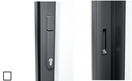
With profile cylinder (semi cylinder), turning knob inside, push handle inside, with shell handle outside