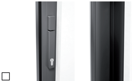
With profile cylinder (semi cylinder), turning knob inside, push handle inside, without shell handle outside