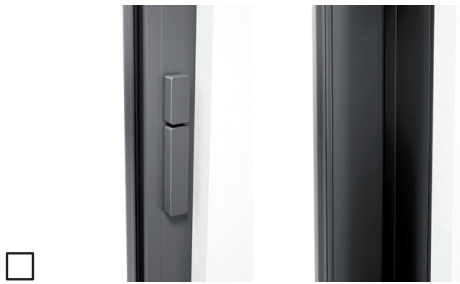
Without profile cylinder, turning knob inside, push handle inside, without shell handle outside