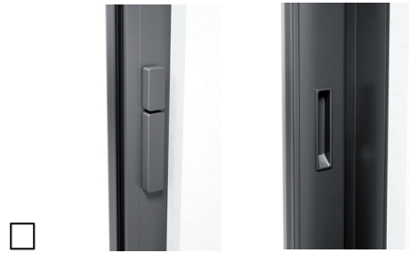
Without profile cylinder, turning knob inside, push handle inside, with shell handle outside