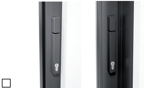
With profile cylinder (full cylinder), turning knob inside + outside, push handle inside + outside

Locking inside: System colour (Standard) Special colour: _____